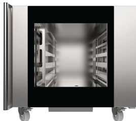
Proofer (as base)