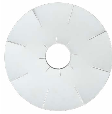
follower plate for a mixing-bowl