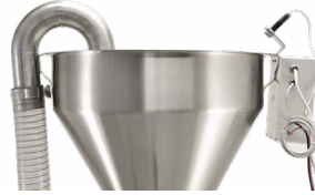
product level sensor